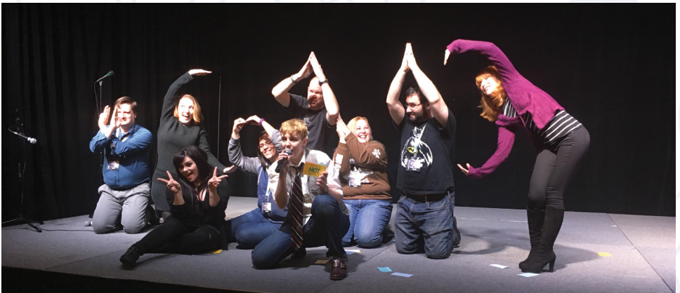
Last year's guests tried to spell out COAF. Points for effort!